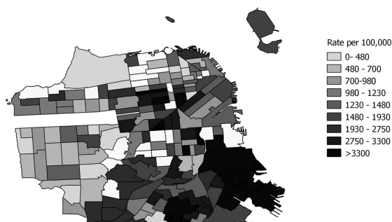
Figure 1 Chlamydia incidence among women under age 25 by census tract for San Francisco, 2010.

Our findings are consistent with the established literature linking incarceration with increased STI risk. In 2005, significant correlations were found between county-level incarceration rates and chlamydial and gonorrhoea rates in North Carolina, 16 and a subsequent analysis in Durham County, North Carolina, identified an association between census tract incarceration rates and gonorrhoea rates. 17 An ecological study in Chicago neighbourhoods employed homicide rates as a proxy for incarceration rates and identified an association with STI rates. 18 Thomas et al have posited several potential mechanisms for the association between incarceration in communities and STIs. First, recently released individuals could bring infection (acquired prior to incarceration and never treated, or acquired while incarcerated) back to the community upon release, resulting in increased STI rates. 16 Next, the effect of incarcerating large numbers of men changes the male:female sex ratio, such that